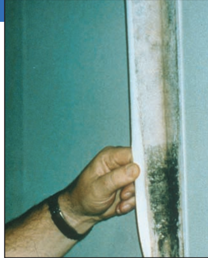
Mold growing on the back side of wallpaper.

Suspicion of hidden mold You may suspect hidden mold if a building smells moldy, but you cannot see the source, or if you know there has been water damage and residents are reporting health problems. Mold may be hidden in places such as the back side of dry wall, wallpaper, or paneling, the top side of ceiling tiles, the underside of carpets and pads, etc. Other possible locations of hidden mold include areas inside walls around pipes (with leaking or condensing pipes), the surface of walls behind furniture (where condensation forms), inside ductwork, and in roof materials above ceiling tiles (due to roof leaks or insufficient insulation).