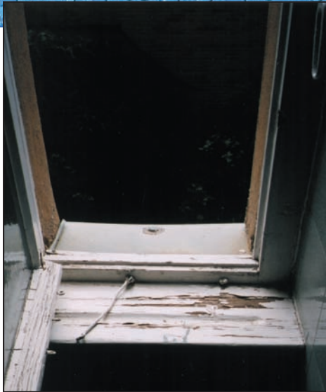
Leaky window – mold is beginning to rot the wooden frame and windowsill.

If you already have a mold problem – ACT QUICKLY. Mold damages what it grows on. The longer it grows, the more damage it can cause.