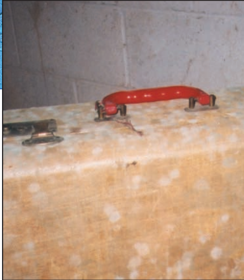
Mold growing on a suitcase stored in a humid basement.

It is important to take precautions to LIMIT YOUR EXPOSURE to mold and mold spores.