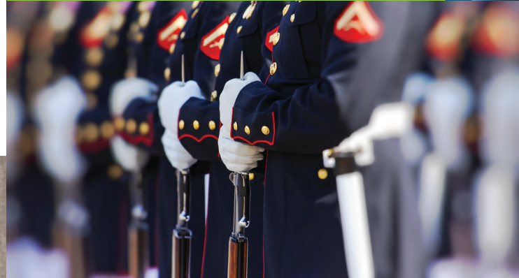
MARINE CORPS BIRTHDAY - NOVEMBER 11TH