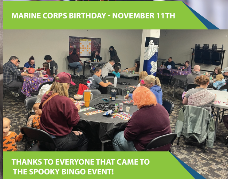
THANKS TO EVERYONE THAT CAME TO THE SPOOKY BINGO EVENT!