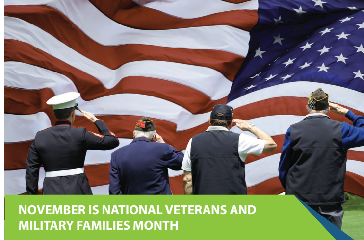
NOVEMBER IS NATIONAL VETERANS AND MILITARY FAMILIES MONTH

November 21st we will have a Turkey craft day from 11 AM to 3 PM at the Leasing Community Center, 2785 Cascades Pass Blvd.