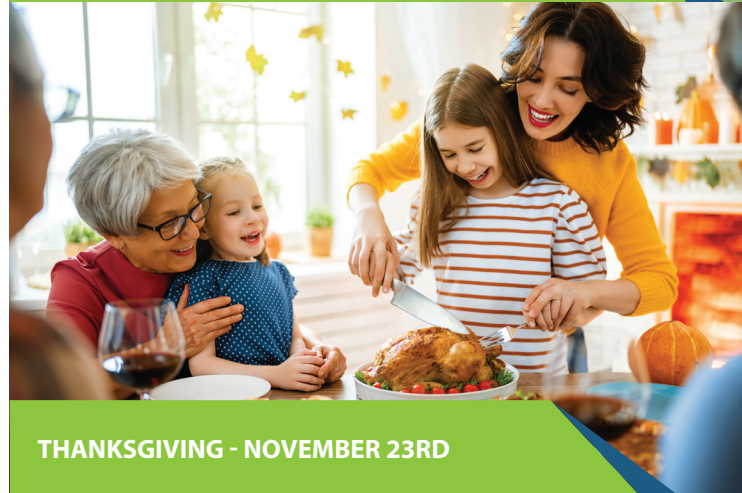
THANKSGIVING - NOVEMBER 23RD